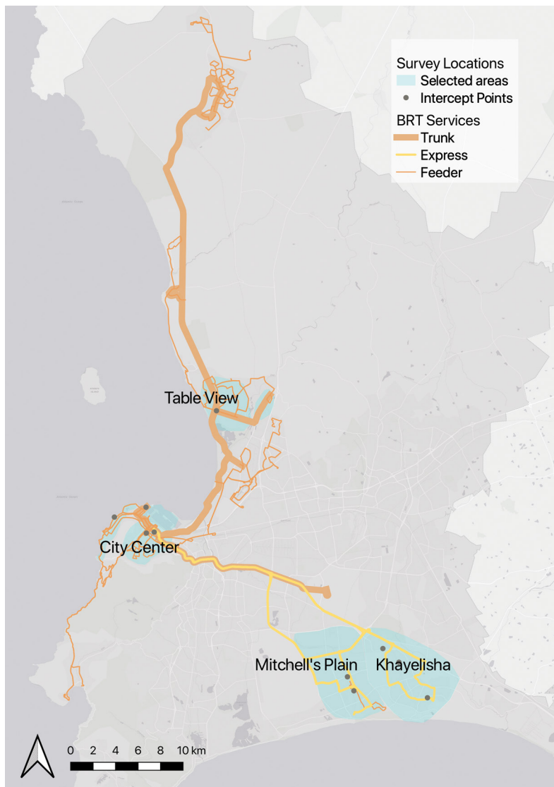
Figure 3. Cape Town survey sites