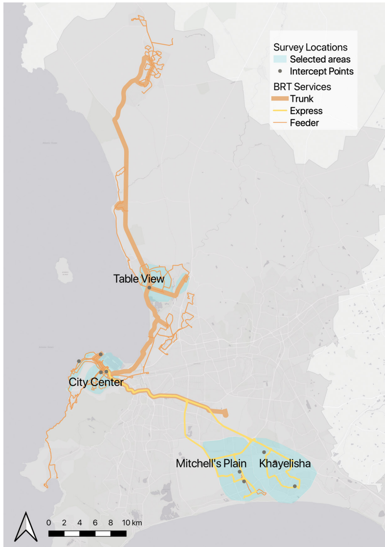
Figure 4. Barranquilla survey sites